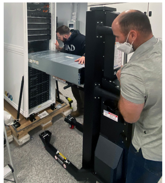
Assembly and Mounting